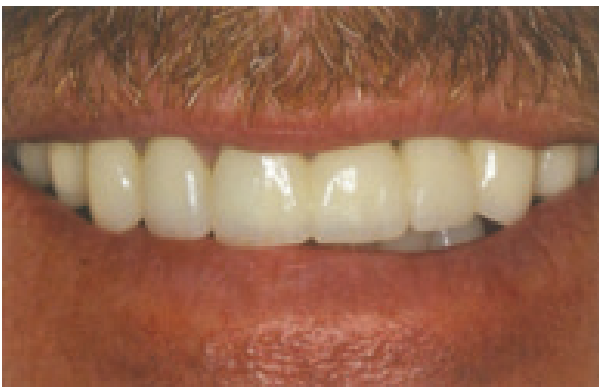
Illustration 5: Unnatural looking veneers that are over contoured and artificial looking.

The final veneers are then bonded (attached) to the teeth using dental adhesives. This step is crucial as well as a strong bond between the porcelain and the tooth will ensure a long lasting restoration. Below are examples of completed smiles.