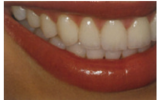
Illustration 8: Beautiful teeth.... or are they veneers?

The aim of the treatment is to create a smile that looks completely natural. It is true to say that great aesthetic dentistry often goes unnoticed.