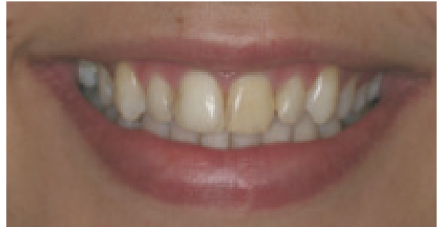
Illustration 7: Before and after pictures of case from Illustration 1. Note the naturalness of the smile.