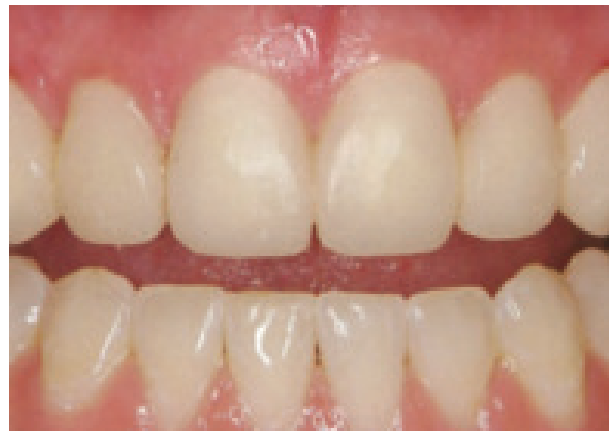
Illustration 3: Provisional restorations produced from wax-up. These have the contour of the desired veneers, but lack the surface texture and final flare.

After the teeth are prepared the provisional restorations are made, these provisionals are a test drive of the final product. No other form of aesthetic surgery or treatment allows the patient to test drive the result before it is finalized. The patient may wear the provisional veneers until they are satisfied that the fit, form and contours of the veneers are up to par.