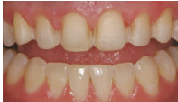
Illustration 2: Conservative tooth preparation. The preparation of the tooth is limited to enamel in this case.

This preparation differs from patient to patient. At times the preparation is very minimal, and in some cases the requirements call for more drastic changes in color and shape and the preparation of the teeth differs.