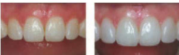
Illustration 6: Before and after of very natural-looking porcelain veneers.

The final veneers are then bonded (attached) to the teeth using dental adhesives. This step is crucial as well as a strong bond between the porcelain and the tooth will ensure a long lasting restoration. Below are examples of completed smiles.