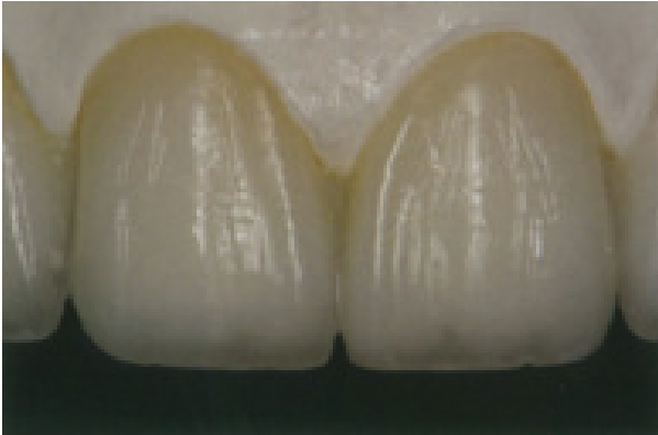
Illustration 4: Veneers being fabricated on the dental models. Note the surface textures, colour and detail.

Once the provisionals are approved, the production of the porcelain begins. The artistry is monumental as we are trying to mimic nature and produce the most realistic results. When attention is not paid to this final step, veneers may end up looking artificial and not lifelike. Our ceramists are skilled at mimicking nature and building the teeth to the specifications dictated by the provisionals and the doctor's artistry.